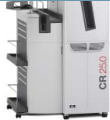
CR 25.0 can easily be placed at any location, even in combination with the CR User Station.