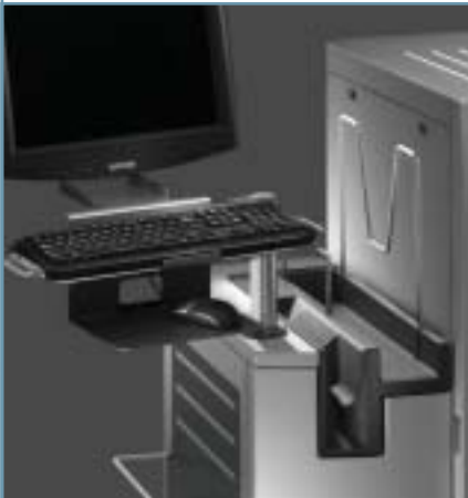
Integrated CR User Station for time-saving identification and optimized workflow