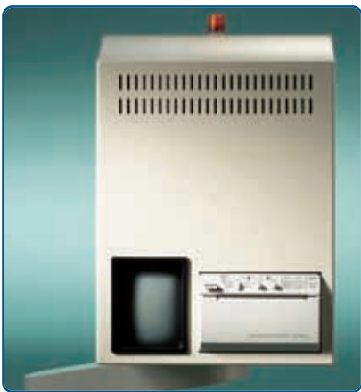
Reference monitor and hardcopy printer at the rear for the convenience of the user.