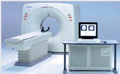
Asteion™/DUAL whole-body CT scanner