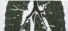
Chest (bronchus) multiplanar reconstruction (MPR) image