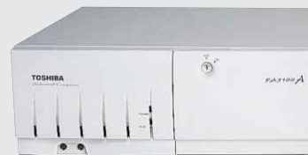
XIDF-100A reconstruction unit