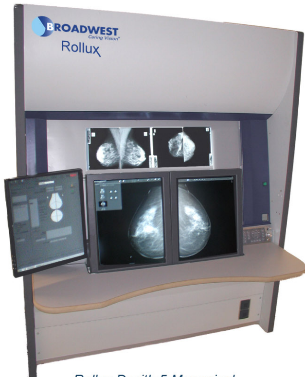
Rollux D with 5 Megapixel Monitors Installed

The missing link between analog and digital mammography viewing