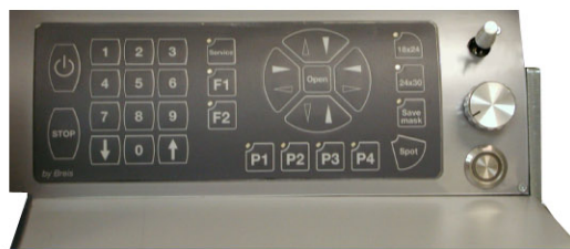
Keypad, light dimmer and joystick for shutter control

No turning left or right, no digitizing file rooms. Auto-masking with one button or footswitch to keep reading without mechanical distractions. Transmitted light around films is minimized by auto-dimming and masking.