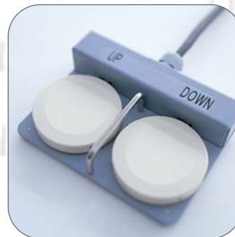
Remote elevator control.