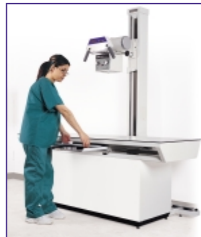
The AmradClassic ST is available with an optional attached tubestand for space-saving installation without wall or ceiling modifications.