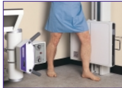
The versatile tubestand and wallstand accommodate standing knee and ankle procedures.

The ST delivers both reliability and versatility in a compact table system. Ideal for busy clinics with demanding caseloads, the heavy-duty, all-steel design and construction easily supports patients up to 300 pounds. The optional integrated tubestand is important when space is at a premium. The AmradClassic ST design provides continuous attachment of the tubestand to the table and installs without modification to most office walls or ceilings. A unique off-table tubestand option accommodates a full range of procedures including standing knee and ankle.