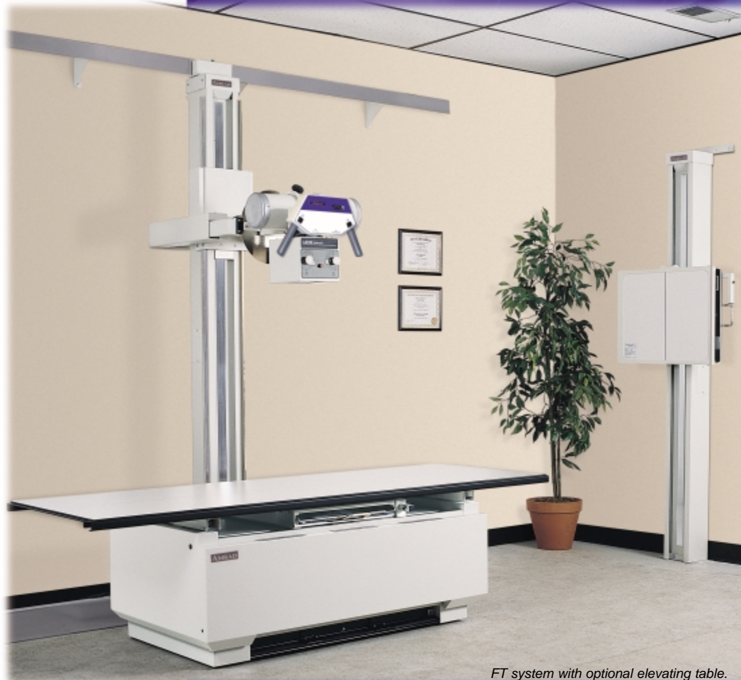
FT system with optional elevating table.