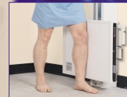
The extended tube travel of the orthopedic tubestand eliminates the need for a platform during weight-bearing knee procedures.