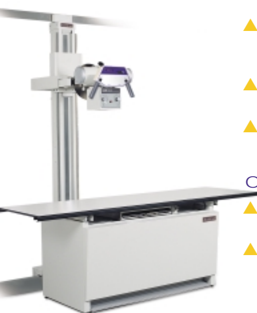
FT float-top table.