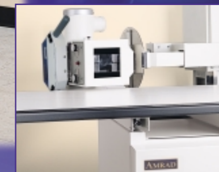
The table features a completely flat working surface for table-top procedures with no image distortion.